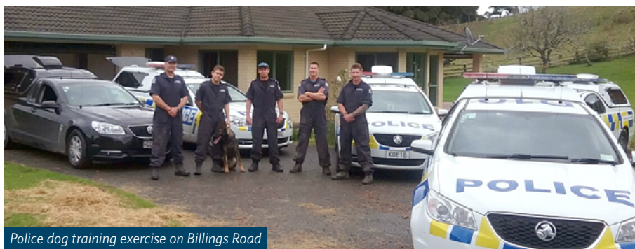
Police dog training exercise on Billings Road