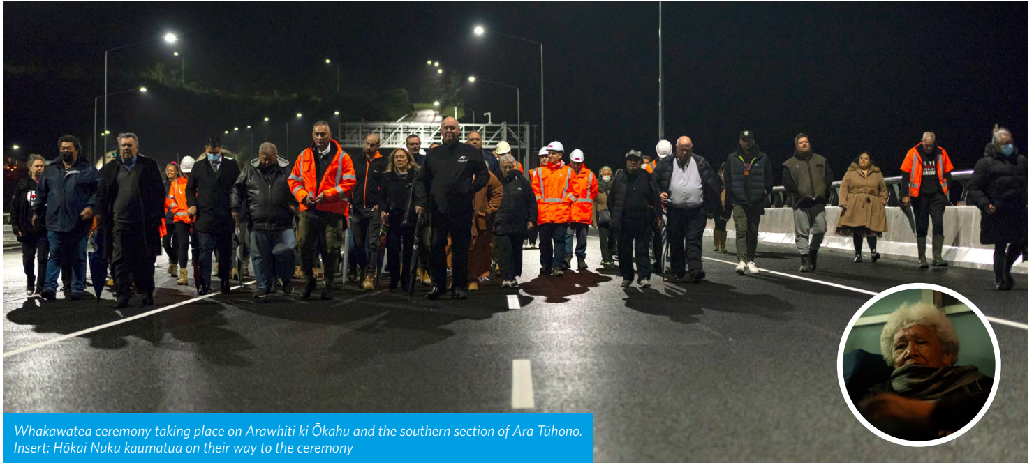
Whakawatea ceremony taking place on Arawhiti ki Ōkahu and the southern section of Ara Tūhono. Insert: Hōkai Nuku kaumatua on their way to the ceremony