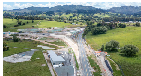
AM&M Building and Pukerito/Northern Connection.