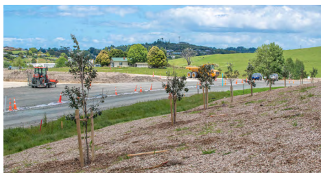
Landscaping on the project.