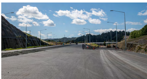
Arawhiti ki Pūhoi and on ramp.