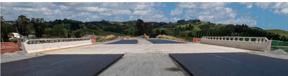
The approaches to Mahurangi Bridge freshly paved.