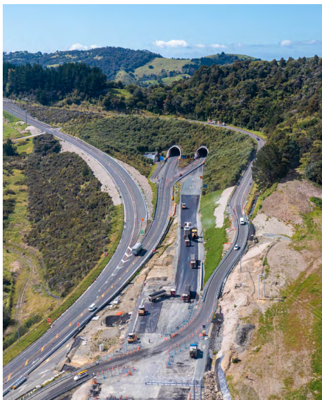
Aerial view of the Southern Connection.