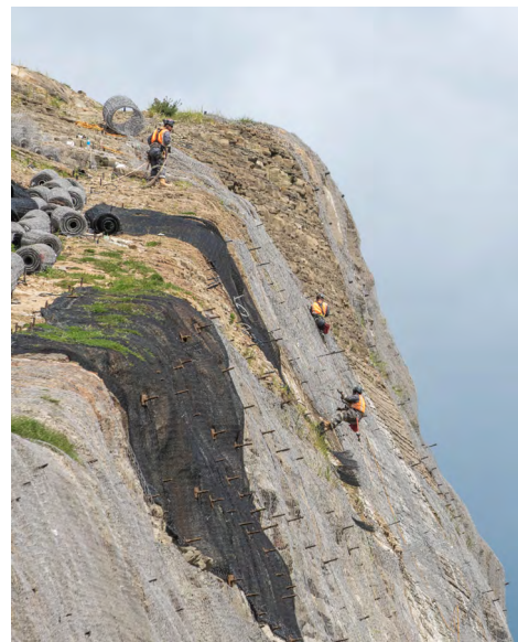
Rock mesh installation.