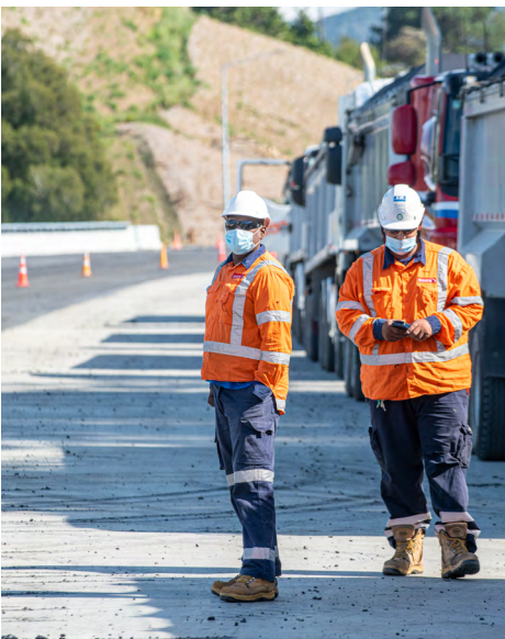
Pavements team in project PPE.