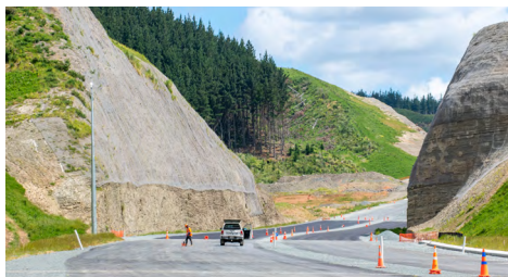
Central North cut.