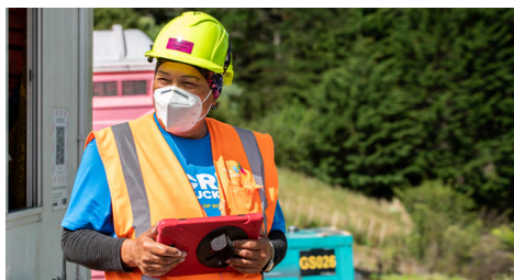
Our gate staff ensuring safe entrance to the site.