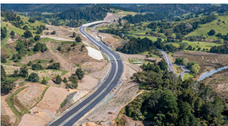
Pavements progress and Arawhiti ki Pūhoi.