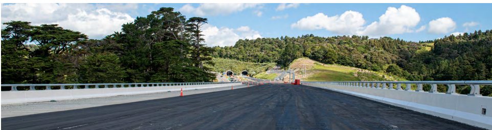
Arawhiti ki Ōkahu looking towards Johnstones Tunnels.