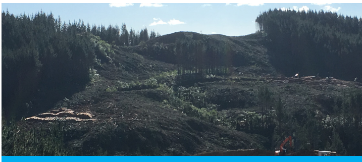
N5 nictured in 2017 when it was still a mountain