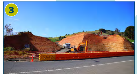
This is the point where Arawhiti ki Pūhoi (Pūhoi Viaduct) will join into the motorway alignment. In the next few months you will see the piling team in this area preparing for the abutment to be poured. Once completed the bridge will pass over Pūhoi Road at approximately 6 metres above the current road level.