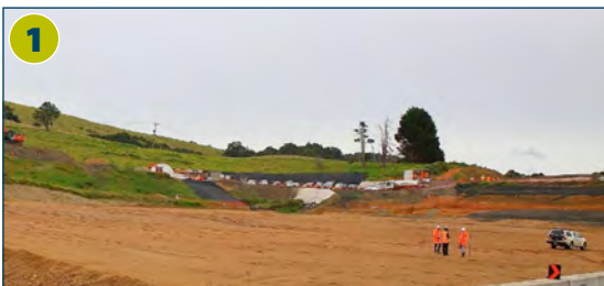
Over the past few months, the team have been placing fill in this area, and there's still another 140,000m 3 of fill to go. To help with the drying process, a tractor with discs on the back is used to drive over the materials, aerating materials as it goes.