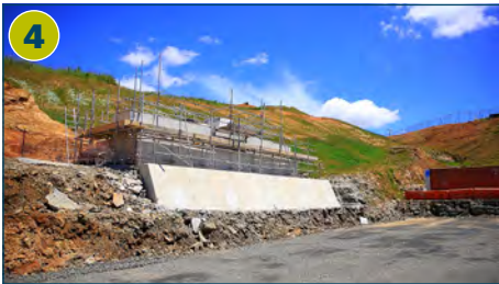
In December, the girders will arrive on site. These will connect the abutments on the eastern and western sides of the bridge.