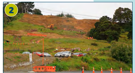
The team have started excavating the hill just north of the Pūhoi site compound. This will be a 30m 'cut' below the current height of the hill. This will also be the location where the motorway will connect to Arawhiti ki Pūhoi (Pūhoi viaduct).