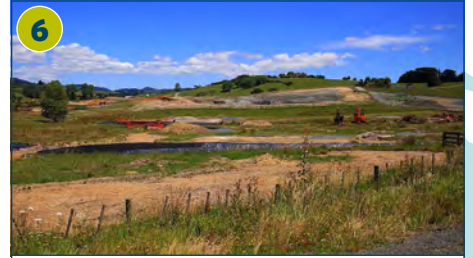
Earthworks and ground improvements have started at the northern most part of the project, known as the 'Northern Connection'. Excavation has started south of the roundabout location. Early in the new year, preloading will start as part of the ground improvement works. Wick drains will also be installed further north.