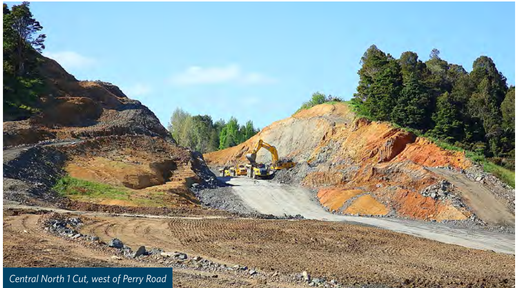
Central North 1 Cut, west of Perry Road