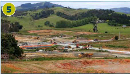
Work on the new section of Woodcocks Road and Carran Road is in the final stages and soon local traffic will be switched to the new road layout.

We're now working across the extent of the project and works have become more visible from the roadside. We would like to remind everyone, that with the work now highly visible, it's important that you don't get distracted when driving past. Here's a snapshot of some intriguing areas of construction.