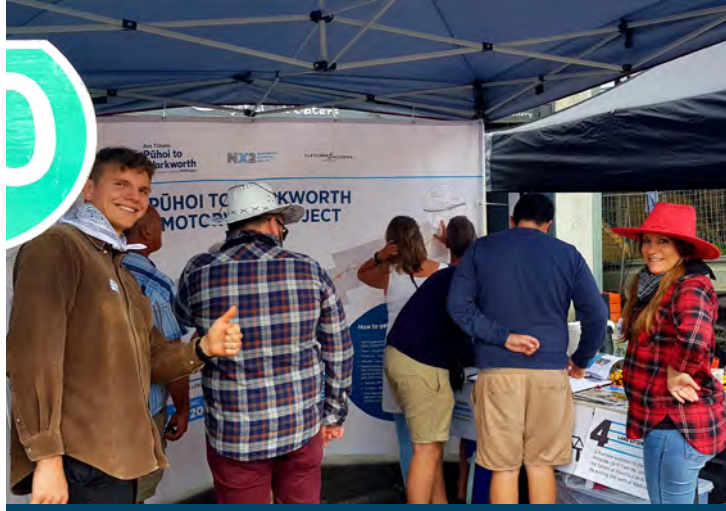
Project cowboys & cowgirls at this year's Huge Day Out