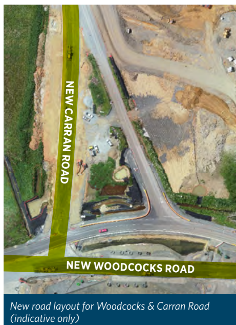
New road layout for Woodcocks & Carran Road (indicative only)

As construction continues to be close to the roadside, barriers will be in place separating live traffic from the construction activities. Stop/Go traffic management will be required for specific activities making sure everyone passes through the area safely. Thank you for your ongoing patience.