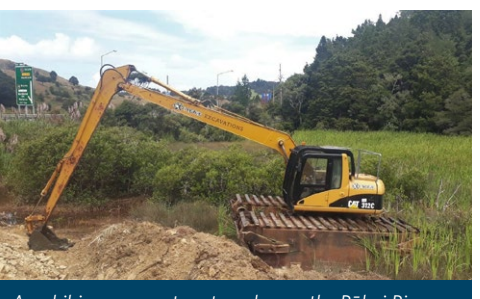
Amphibious excavator at work near the Pūhoi River

A recent challenge for the team in the south has been fishing and muck-out of a gully near the Pūhoi River. The area is challenging due to the low-lying and wide profile of the gully, influenced from the incoming tide up the Pūhoi River. The gully had thick vegetation, making it impractical to fish and carryout fish relocation using traditional methods. The solution has been to use a 12t digger fitted with large 'floats', allowing it to float on top of the surface and remove surface vegetation, while an ecologist is present to assist with any fish identification and relocation.