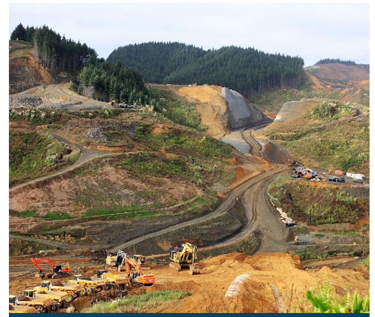
View from the purpose-built viewing platform, overlooking some of the project's most significant cuts and fills. Here people could start to see the new motorway taking shape and gain a first-hand appreciation of the scale of the project.