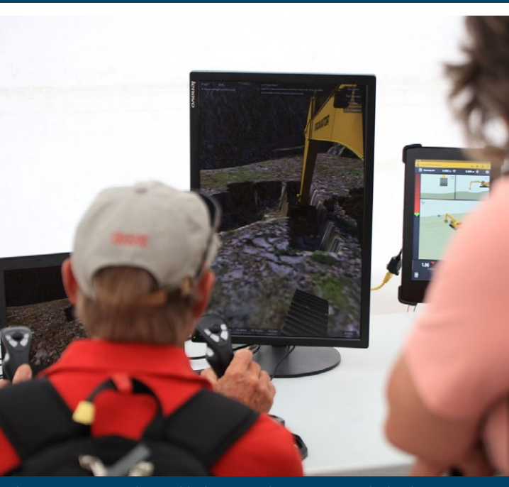
The survey team ran the Trimble digger simulator, giving people the chance to scoop up some virtual dirt - which is much harder than you may think!