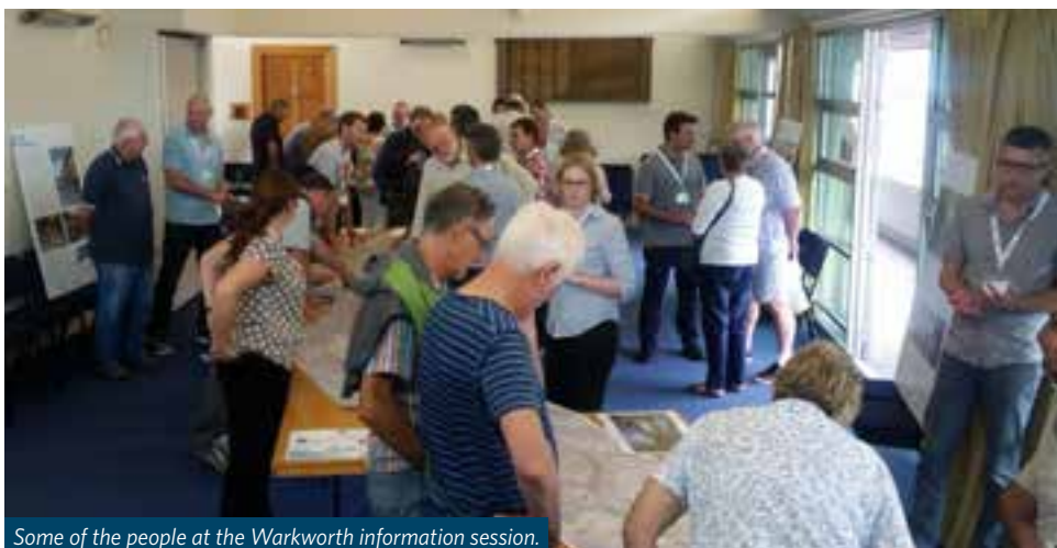
Some of the people at the Warkworth information session.

Information displayed at the events can be found on the project website www.nx2group.com