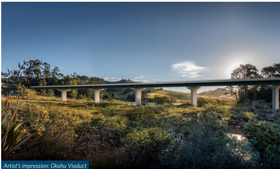
Artist's impression: Okahu Viaduct

Hello to all residents in and around the Pūhoi to Warkworth project area. This is the first issue of what will be a regular newsletter, keeping you informed of what's happening with the Pūhoi to Warkworth motorway project.