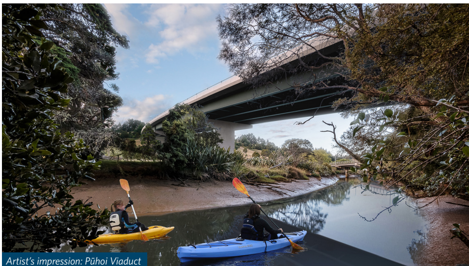
Artist's impression: Pūhoi Viaduct